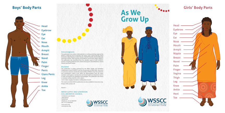
'As We Grow Up'.

and healthy gender dynamics, based on participatory research with adolescent boys. The Water Supply and Sanitation Collaborative Council (WSSCC) also has a puberty flip book that contains guidance on boys' and girls' body changes and how best to introduce the subject (see 'As We Grow Up' image below).