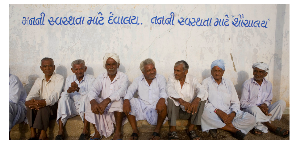
Sanitation campaigns. Men sit above a sign that says 'for cleansing of your soul you need temple, for cleansing of your body you need toilets' in Rajpara Bhayati Village, Vallabhipur Block, 2008.

In Nepal, Krukkert et al. (2010) reported that men were unlikely to attend hygiene promotion activities if they were 'just members of the audience'. They are more likely to attend hygiene promotion activities if they are given specific roles. The authors recommended an information-sharing role or some sort of leadership role alongside women. As with the previous examples on the tendency to involve men by making them Natural Leaders, this suggestion again highlights the challenge of engaging men in ways that do not reinforce power inequality.